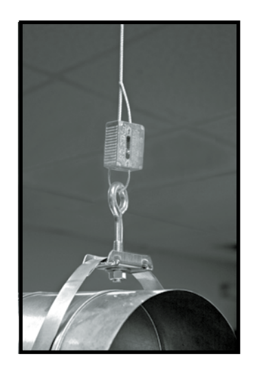
Spiral Buckle with eye bolt and the Dyna-Tite Wire Rope Suspension System