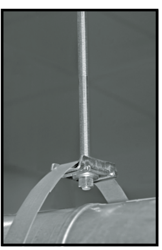
Spiral Buckle with threaded rod