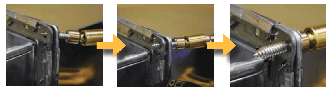
Self-piloting screw tip of the bolt self-aligns the corners and ductwork, eliminating the need for an alignment tool and clamping. 1-1/2" bolt shown.